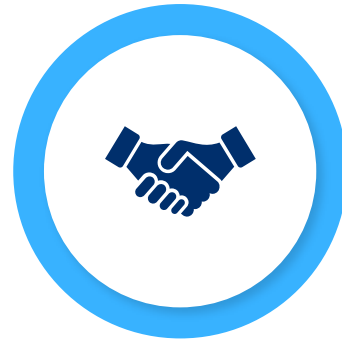
Solid Business Case