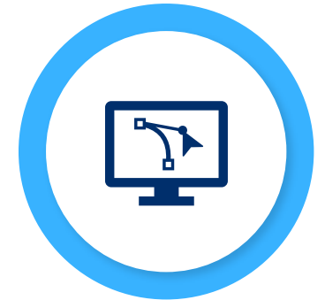
Planned Approach - Technical Upgrade vs. a Redesign