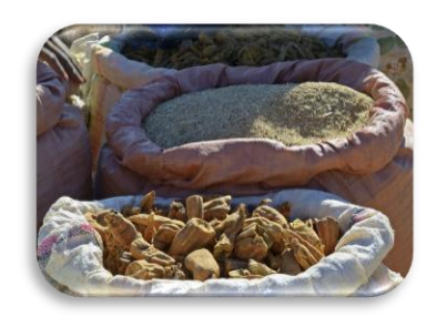
Africa Better access to health insurance with hospital cash microinsurance for women