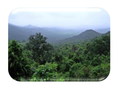
Latin America Supporting the reforestation of Brazil's Atlantic rainforest