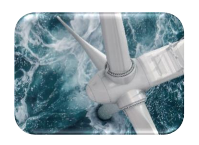
Asia Expanding South Korea's offshore wind capacity