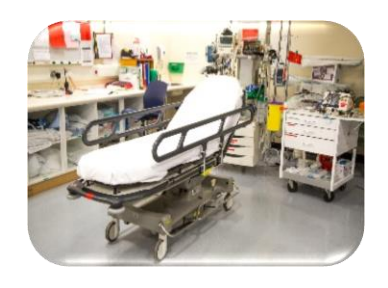
L&H Expanding access to life, disability & critical illness insurance for individuals living with HIV