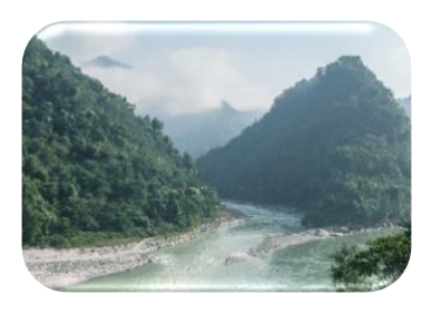
Asia Harnessing Nepal's hydropower potential